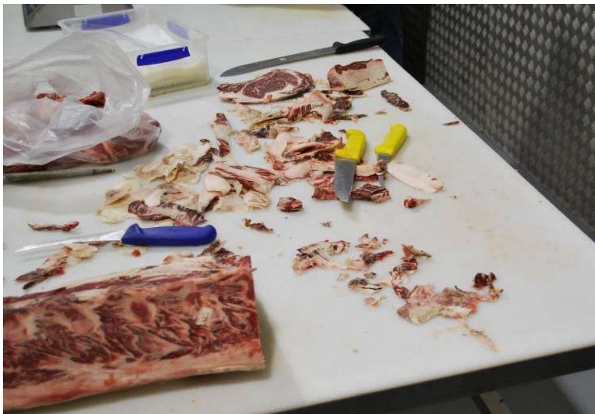
Figure 3: Trim for a dry-aged primal

Companies interested in producing a dry-aged product need to ensure that they are able to provide the required environmental conditions. They will need to test these parameters to ensure that they can produce a quality product on a regular basis. Importantly, due to the discerning market, only the highest quality product should be selected for dry ageing.