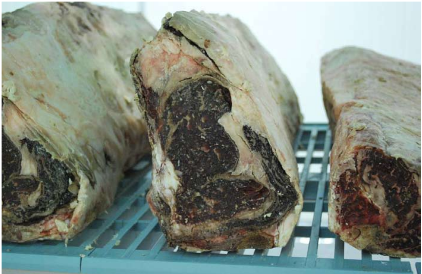
Figure 1: Primal cuts dry ageing on a rack